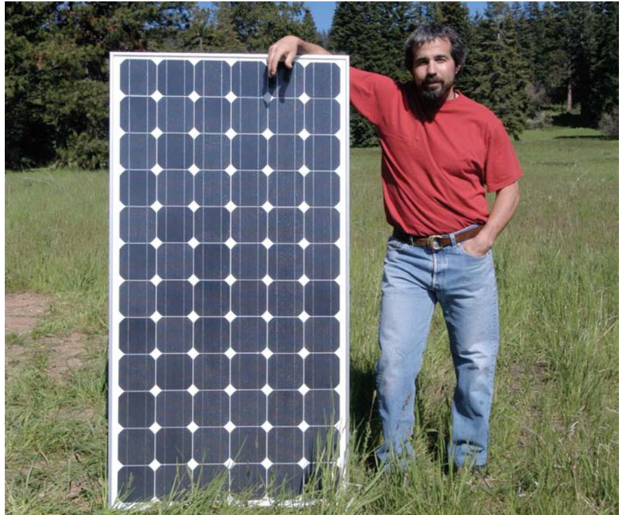
A Sharp 175-watt solar-electric module, 62 x 32.5 inches. The author, 66.25 x 18.5 inches.