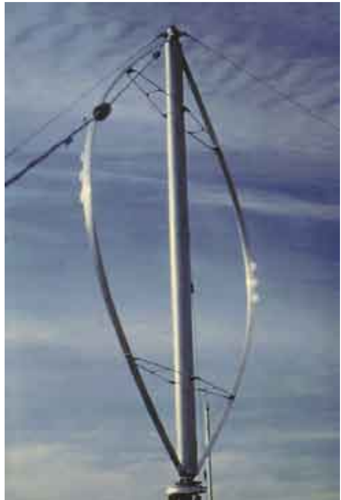
The Darrieus pictured here is a small utility-scale machine. Note the extruded aluminum blades and the guy wires, which are typical for a Darrieus.

Speed Control. Offsetting the VAWT advantage of not needing to yaw is the fact that controlling the output of a VAWT is difficult. You can't have it yaw out of the wind to reduce output, like a side-furling HAWT. This can be a serious problem. A VAWT that makes 2 KW at 20 mph (9