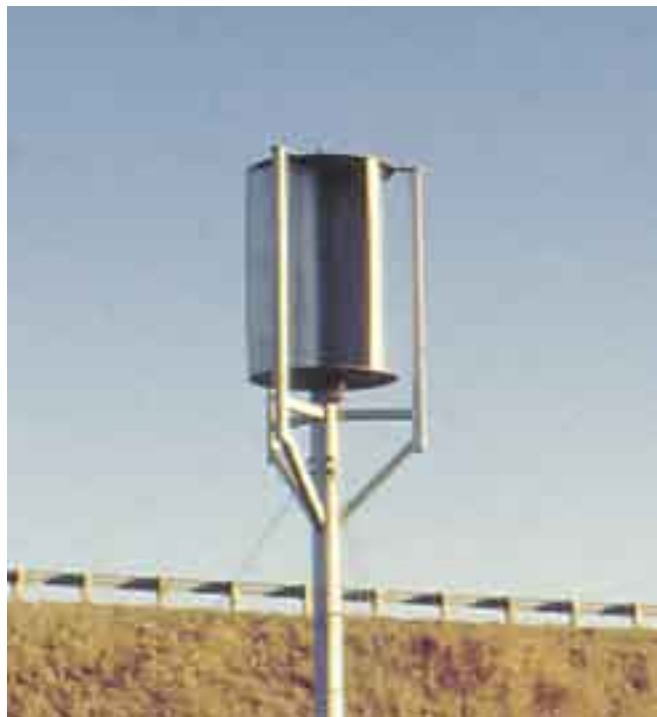
This small Savonius rotor was formed from stainless steel. Metal covers the whole swept area.

of fatigue occurs because for part of each rotation, the blade is operating in the turbulence downwind created by the upwind blade(s), and usually a tube or tower in the center.